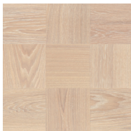
Noble Oak Brooklyn