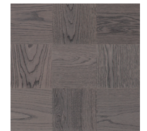
Noble Oak Bronx

The pictures only present the colour of the floor. For more details regarding grading and variations see the Grading Book or www.tarkett.com . Tarkett's international range of floors comprises many different products. Some of these may not be for sale in your country. Although every care has been taken to reproduce images that reflect the finished product, the quality of monitor and printer and the nature of wood results in variations in the color and structure of individual planks. When sanding a wooden floor the appearance will change in colour, texture and surface effects.