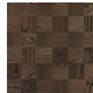
Noble Oak Chelsea