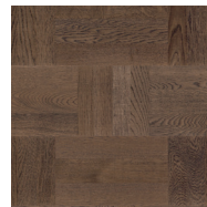
Noble Oak Wasa