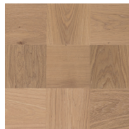
Noble Oak Soho