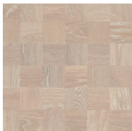
Noble Oak Manhattan