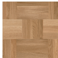
Noble Oak Retro